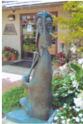
The Denizen of the Great Society Artist: sculpture